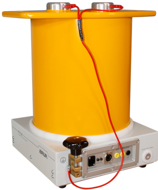
The figure is illustrative