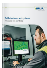
Cable test vans and systems