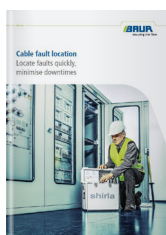
Cable fault location