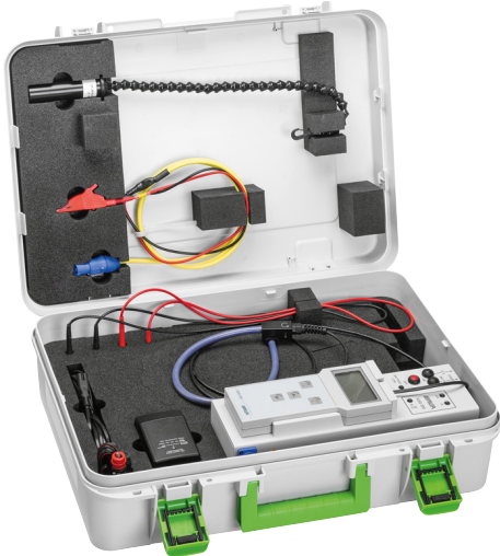
Figure: KSG 200 TA (with battery)