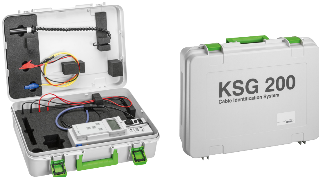
Figure: KSG 200 T (without battery)